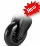
Donut Black Polyurethane