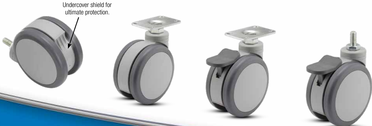
Undercover shield for ultimate protection.